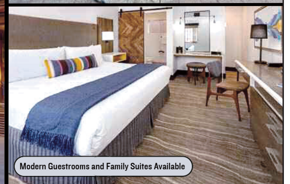
Modern Guestrooms and Family Suites Available