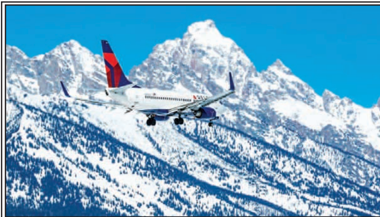
JACKSON HOLE, WY – Wheels down for another flight landing at Jackson Hole Airport (JAC) with the beauty of the Grand Teton Mountains as a backdrop. Find easy access with non-stop flights from 12 major U.S. cities. It is easy to book your flight, just call 1-866-265-4037. JHMR has 4,139 vertical feet of great terrain on 2,500+ acres, half of which are beginner trails and intermediate terrain.

Jackson Hole Airport (JAC) is the only commercial airport in the United States located within a national park, Grand Teton. Upon arrival at the airport, you are an easy 30-minute drive to the mountain resort by car, taxi or rental car. There are no mountain passes, tunnels or four lanes of bumper-to-bumper traffic. Once in Jackson, their public bus system, named START, allows