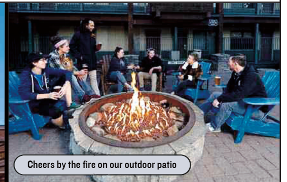
Cheers by the fire on our outdoor patio