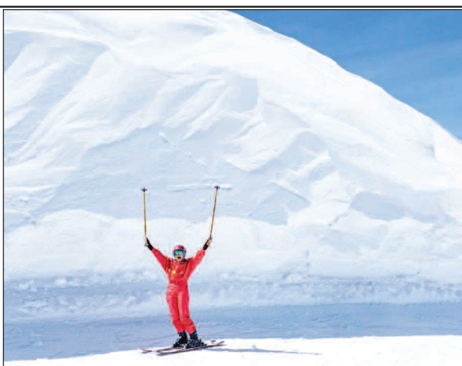
ALTA, UT – Got snow? Alta did in 2023. Alta is again on their way for 2023-24, entering the New Year with 154 inches of Utah's "Greatest Snow on Earth."

Alta's ski school offers children's lessons as well as adult group lessons to help develop your skills. You can choose from beginner group lessons to expert off-trail workshops. From learning to ski on beginner green runs, mastering groomed intermediate blue trails or taking an advanced workshop to gain confidence on groomed black trails, there is a lesson, private or group, that is perfect for everyone.