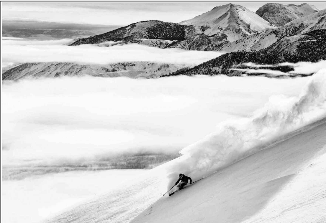
MAMMOTH LAKES, CA - Gently sliding down one of Mammoth Mountain's powder filled trails this skier is focused and may be missing the spectacular above the clouds view. Mammoth received more than 700 inches of snow in the 2023-24 winter season which lasted until August 6th. Powder days as well as cruising days were plentiful.

Did we mention that the mountain got over 300 inches more snow than average in 2022-23? Add in Mammoth Lakes' average of 275 days of sunshine per year and that equals an unreal alpine destination. Where else can you barrel down a powder-soft mountain while the California sun beams through an azure sky and crystalline lakes glim-